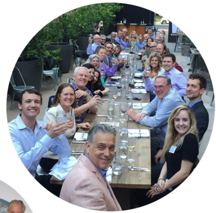
NSAC and CPSC Joint Board Legislative Reception and Dinner, 2016