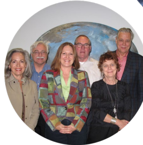
Founding Board Members and Executive Director, 2015