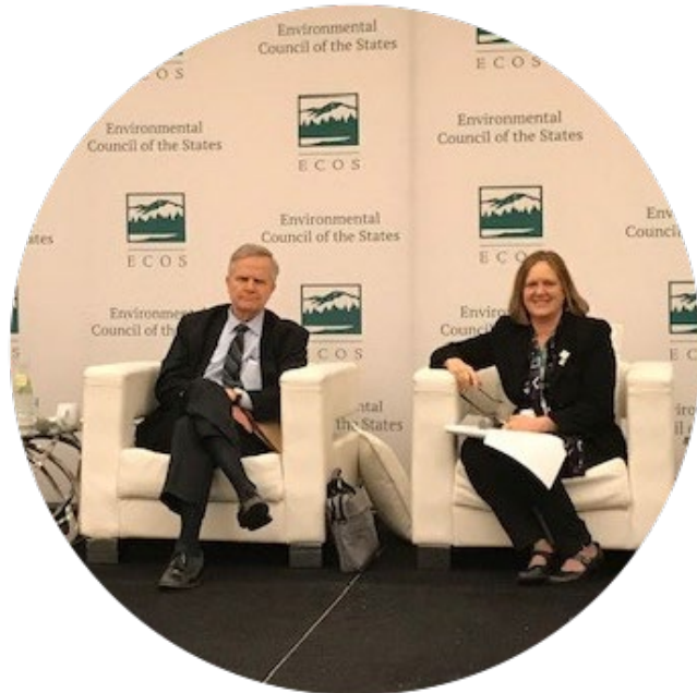
Environmental Council of the States Washington, D.C, April 2019