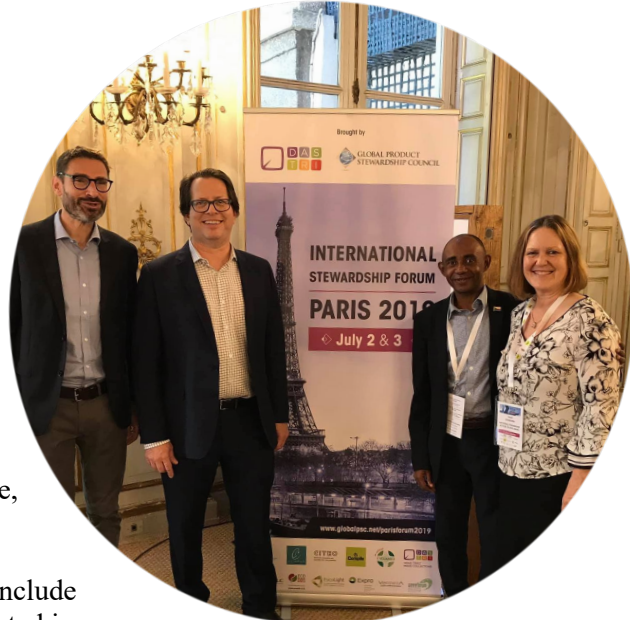
International Stewardship Forum Paris, FR, July 2019